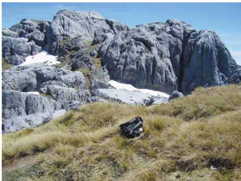
Mt Owen, Kahurangi National Park.

Within the Tasman Wilderness Area, the period during which commercial hunting (the recovery of carcasses for food processing and the live recovery of deer) for deer control purposes can take place has been increased. The exclusion periods for commercial hunting in the wilderness area are now from 22 December to 5 January (of the following