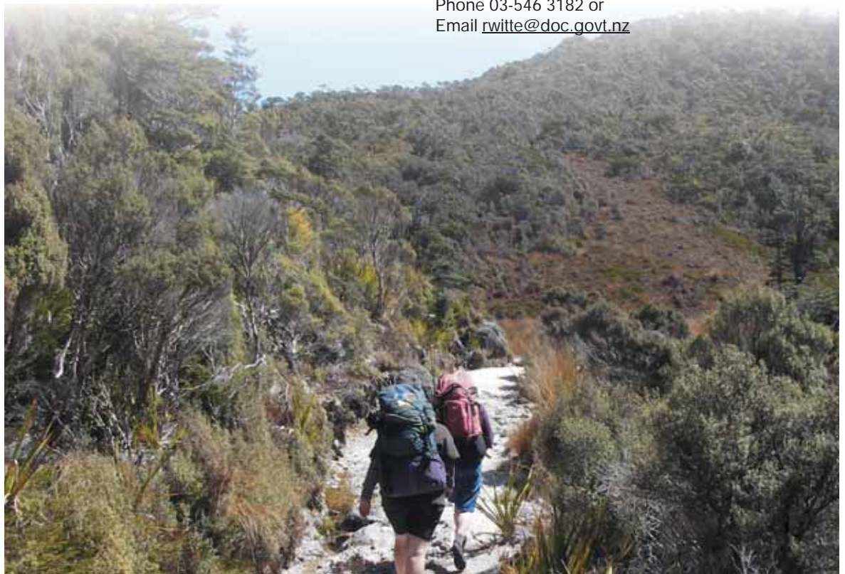
Trampers on the Heaphy Track.