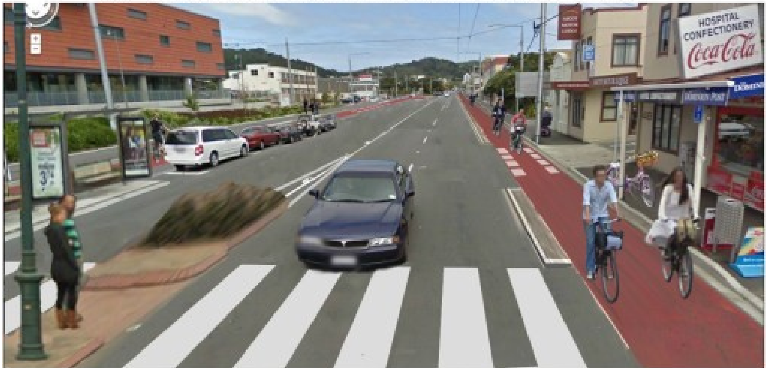
After - Riddiford Street as a safer, more attractive space for all transport modes