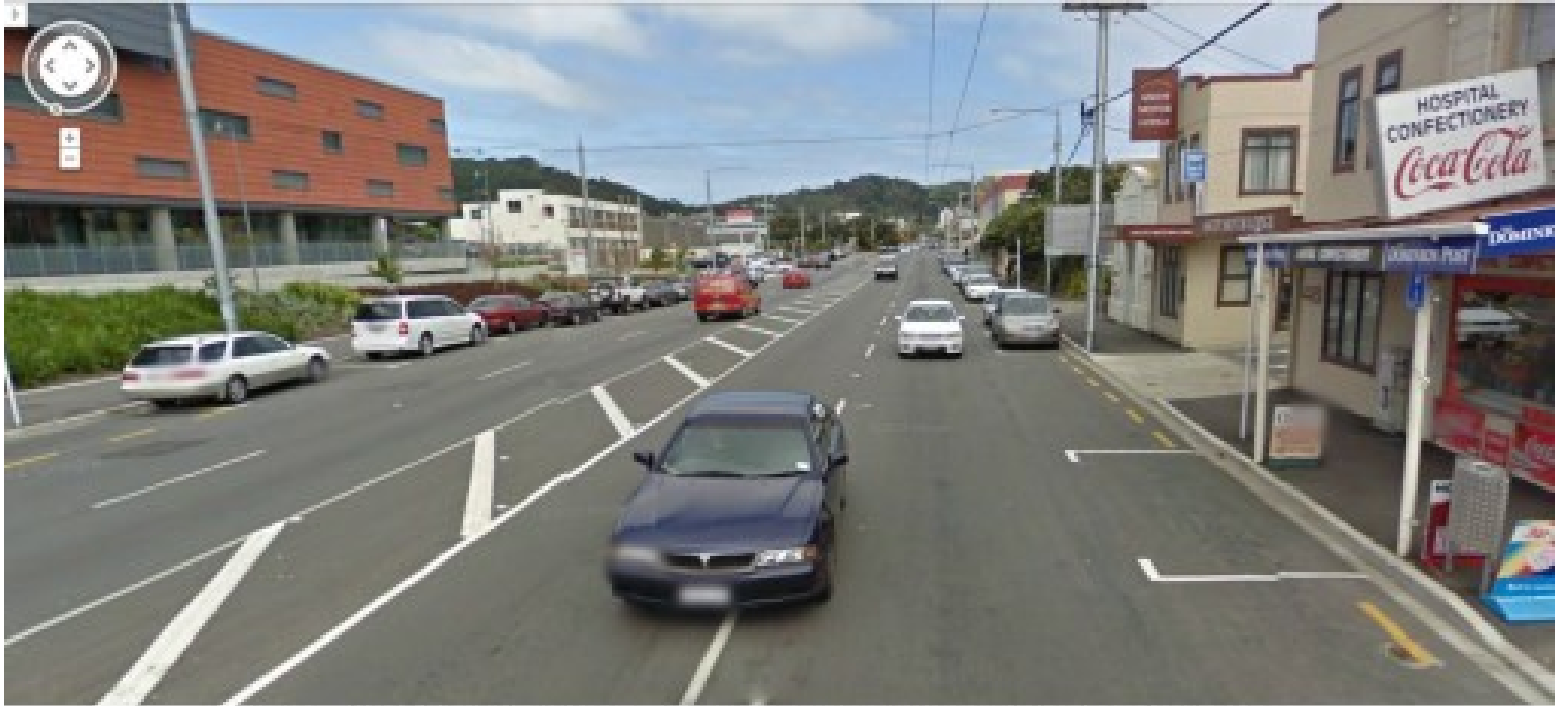
Before - Riddiford Street for maximum encouragement of motor vehicle use