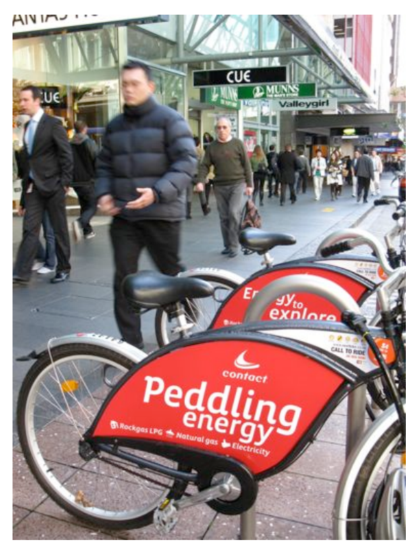
Figure 1 Two Nextbikes and two racks on Queen street, Auckland

Rack locations must be well spread across a variety of sites and have sufficient places to meet demand.