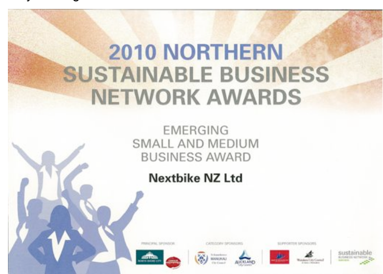
Figure 6 2010 Sustainable Business Network Award for Nextbike

Public bicycles cause the lowest amount of pollution of any public transport mode, help to reduce congestion and increase the attractiveness of city centres as places to live and spend time. Public rental bikes are a very strong and high profile statement of a city's commitment to sustainable development. This is very fitting for the "Positively Wellington" brand.