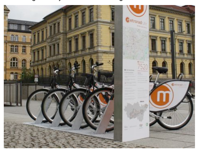
Figure 3 Close-up of Nextbike specific rack and sign

Nextbikes look very tidy when stored on well designed racks, and help to promote cycling as a transport option. The racks that the Council currently use – Sheffield staples or Lollipops work well for short term parking, but can become untidy when subjected to certain weather conditions or to the behaviour of late night revellers. These racks also significantly increase the damage to the bikes.