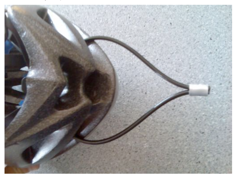
Figure 2 Helmet security loop

Nextbike has customised the helmet with an additional loop of plastic coated, 4mm diameter steel wire. This loop is used to secure the helmet, to the bike and rack using the lock that secures the bike. This customisation does not affect the way the helmet fits or its ability to protect the customers head.