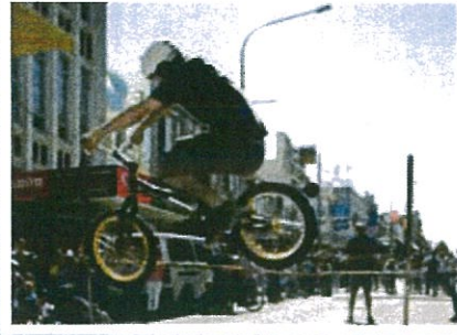
Street party 2009