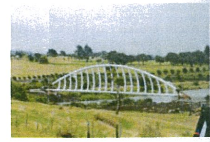
Feb 2010 - New Walking and Cycling bridge