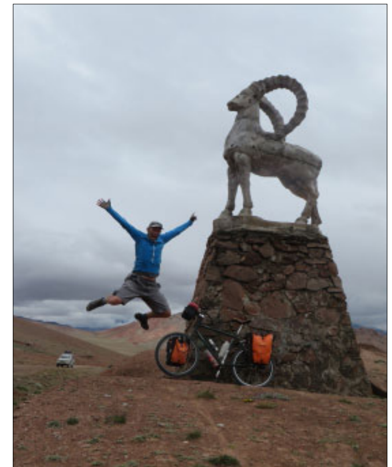
Crossing Kyzyl Art, the last big pass from Tajikistan to Kyrgyzstan

Finding the house wasn't hard, as they were few and far between. It was a whitewashed place, made of mud bricks, with a dung-fueled stove for cooking and heat. Cows grazed the summer pasture during the day, and were brought into the barn at night.