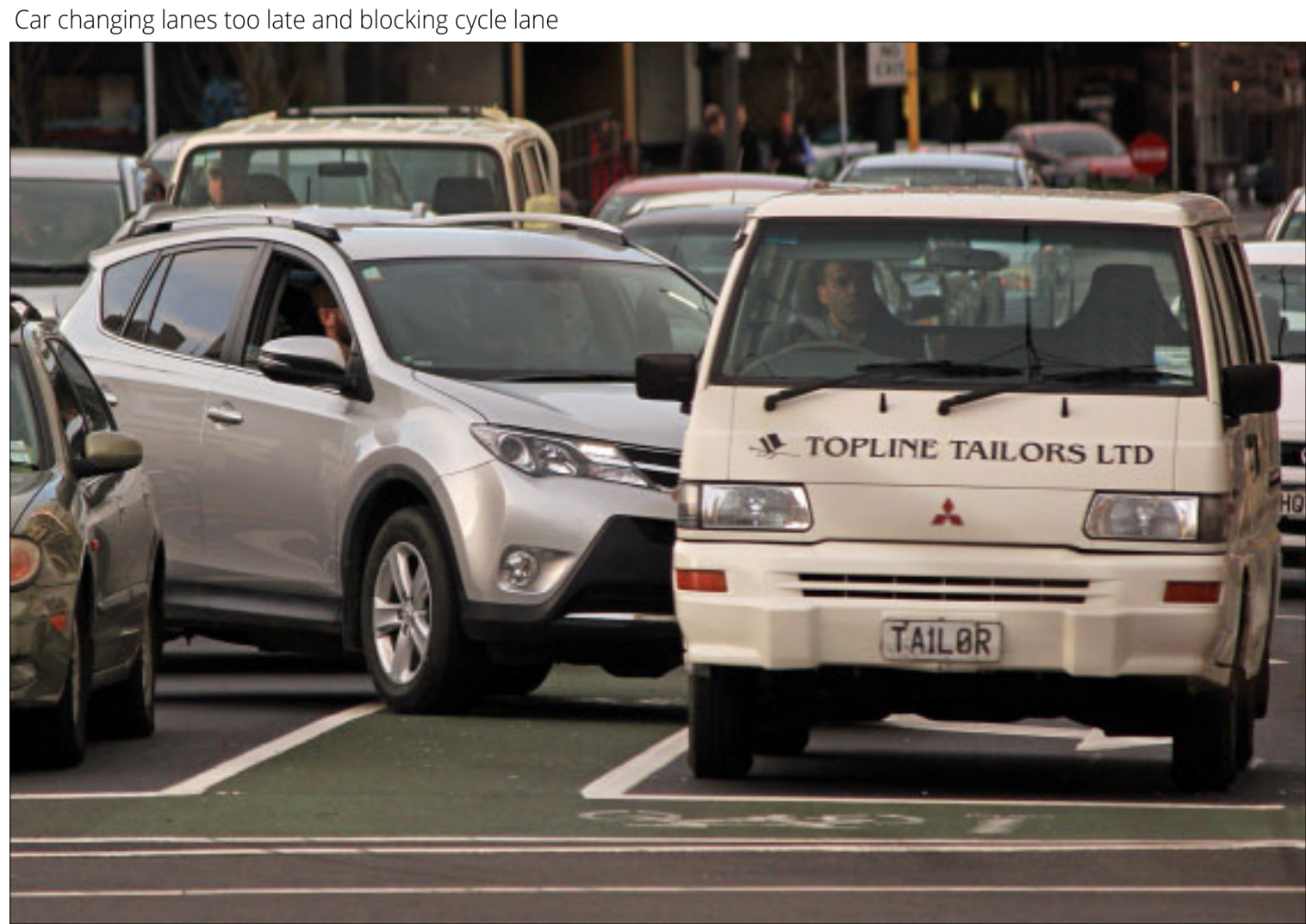
Car changing lanes too late and blocking cycle lane