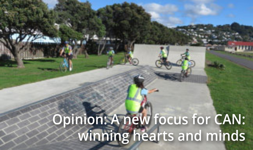
Opinion: A new focus for CAN: winning hearts and minds