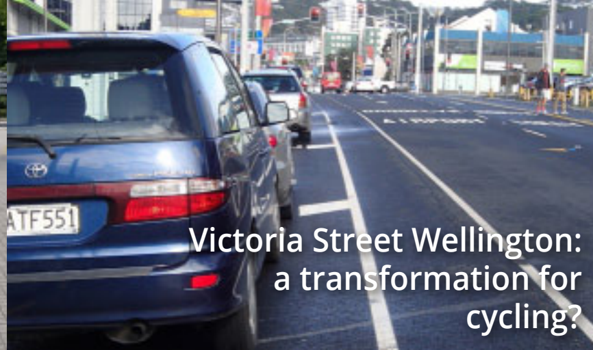
Victoria Street Wellington: a transformation for cycling?