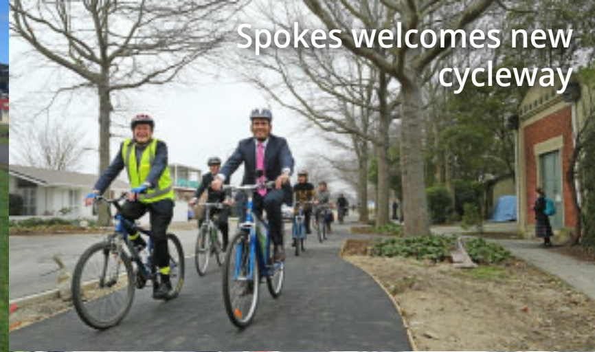
Spokes welcomes new cycleway