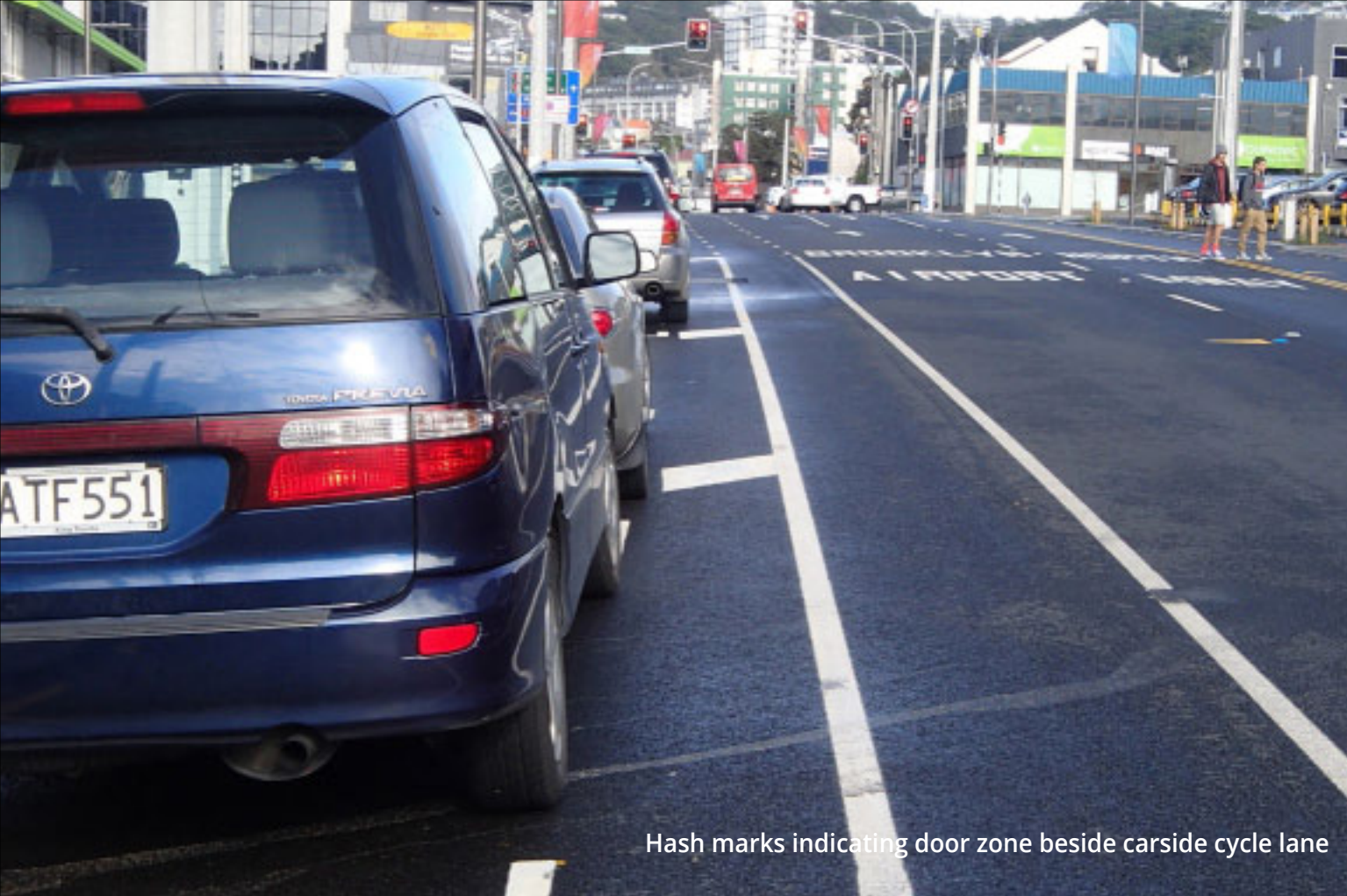
Hash marks indicating door zone beside carside cycle lane