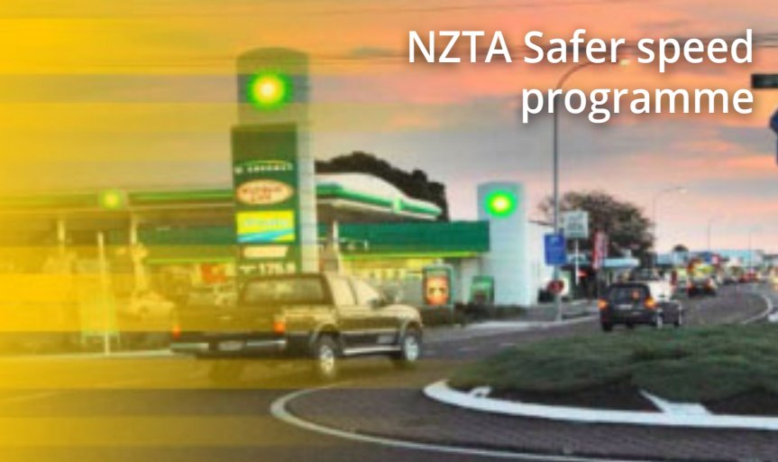
NZTA Safer speed programme