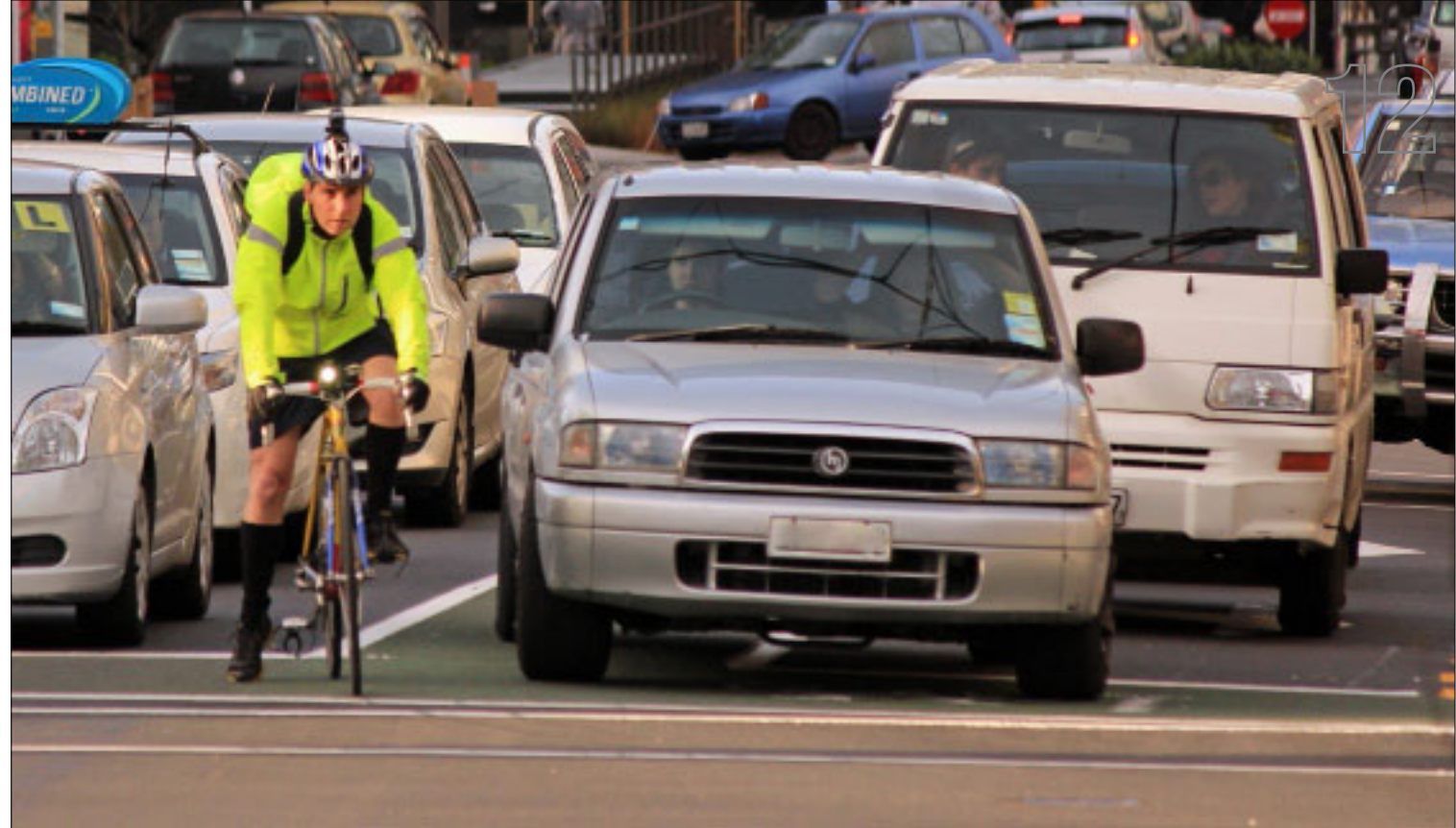
Left turning car getting ready to swing wide and blocking cycle lane

Note: this article is based on a blog post on the Cycle Aware Wellington website