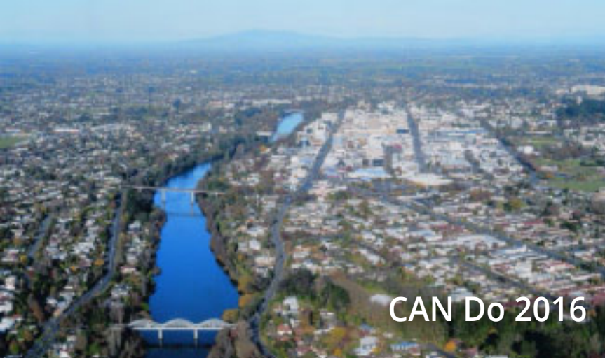
CAN Do 2016