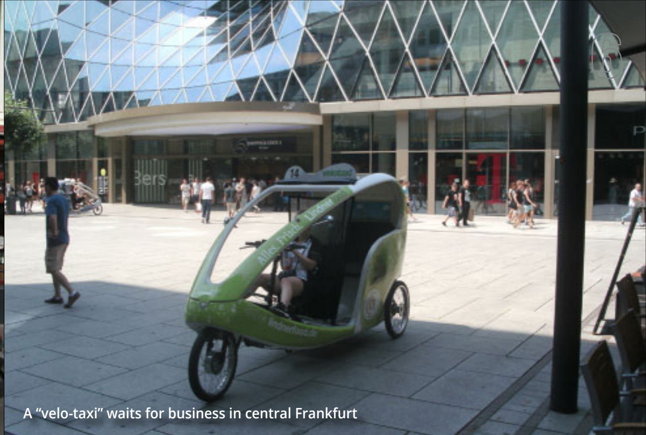
A "velo-taxi" waits for business in central Frankfurt