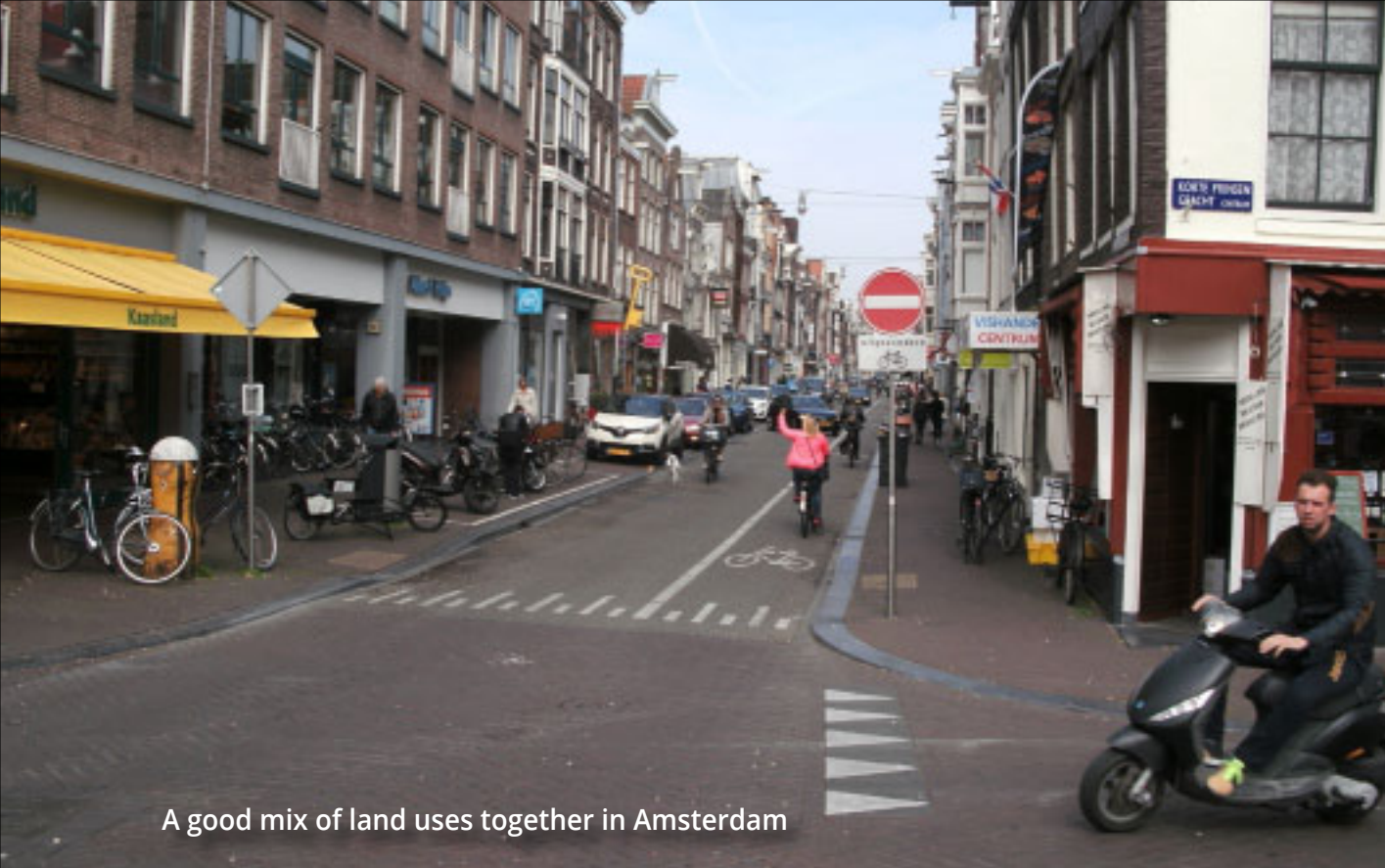
A good mix of land uses together in Amsterdam