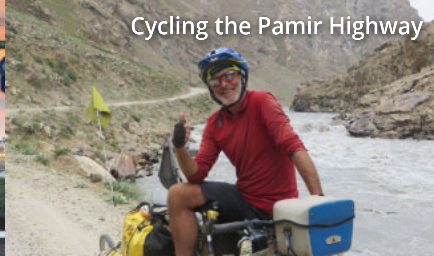
Cycling the Pamir Highway