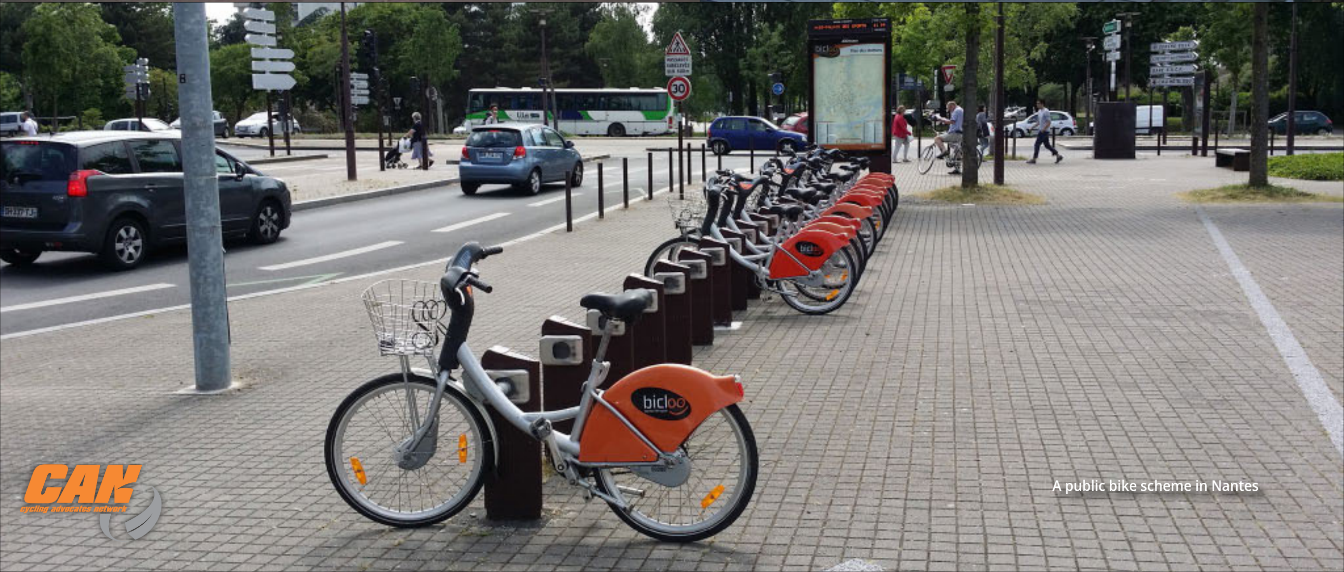
A public bike scheme in Nantes