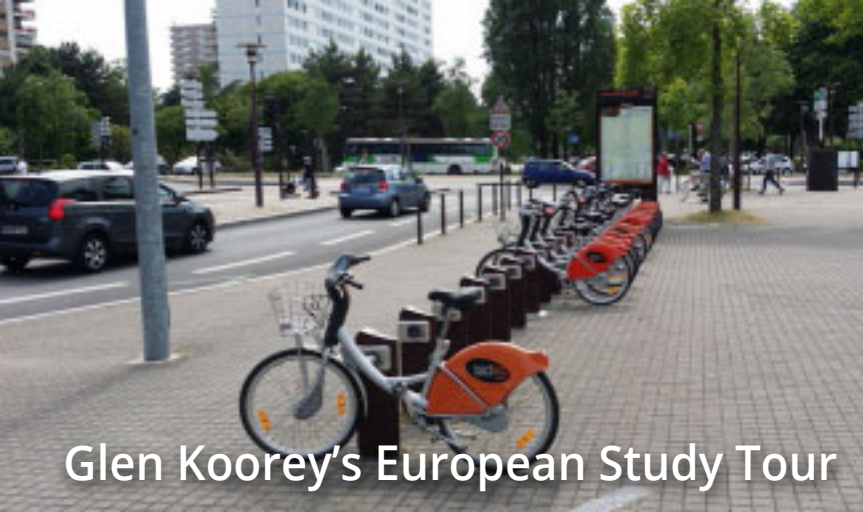
Glen Koorey's European Study Tour