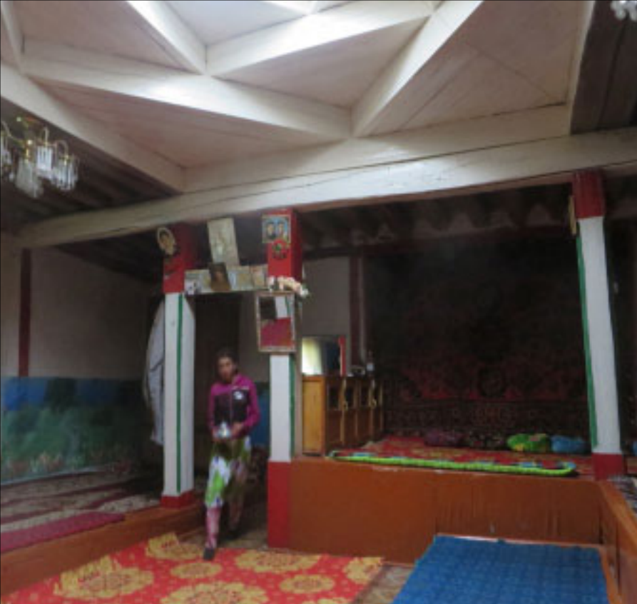
Inside a Pamiri house

Riding the flat bits is fine. But on the climbs, you pedal for 50 metres then stop to catch your breath in the thin air. You see a glint of colour by the road and swing your head just in time to see a marmot take cover behind a rock. You look up at the coming storm and push on for the 4600m summit.