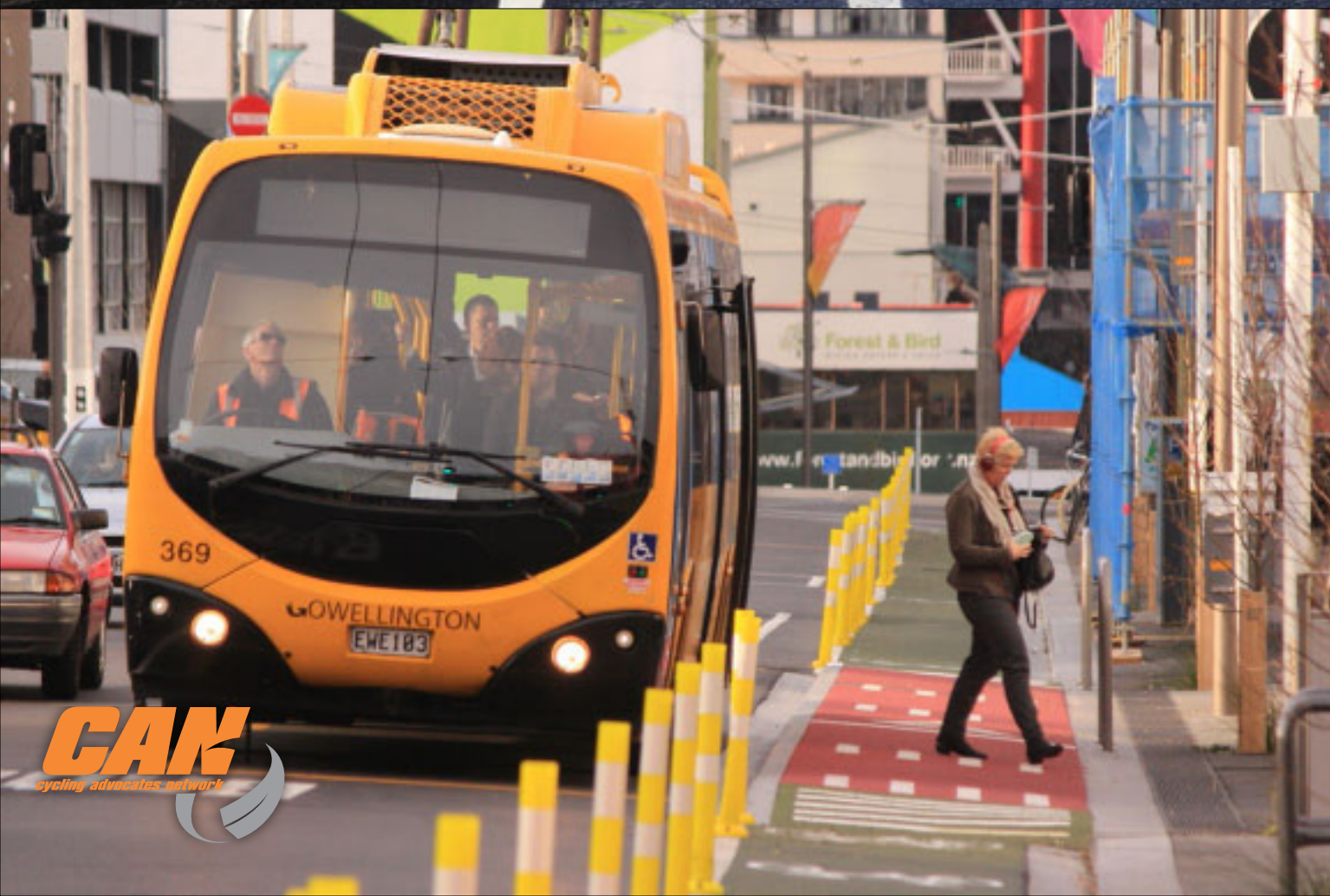
Victoria Street bus stop

Will these cycle lanes encourage the “interested but concerned” to take up cycle commuting? Probably not, since the car-side cycle lanes don’t offer protection from traffic, and the kerbside cycle lane is too short. But the lanes make life easier for the growing number of enthused but confident cycle commuters. Making provision for cycling shows that cycling is a legitimate travel mode, and that can’t be bad.