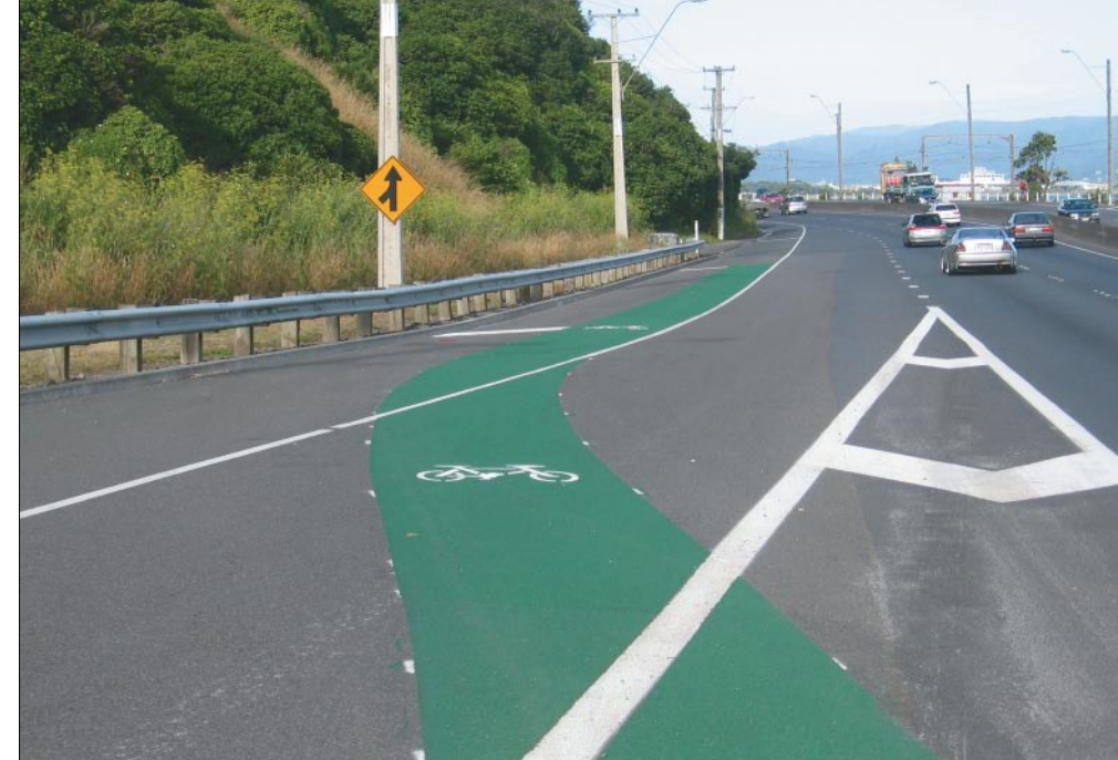
Cycle route to Petone crossing a side tad on SH2.

Greater Wellington Regional Council recently adopted a Cycling Plan which includes actions to 'improve driver and cyclist awareness' and 'encourage participation in cycling'. After strong submissions on the draft plan from cycling advocates, the Council has also pledged to support the development of the 'Great Harbour Way' — a route which includes this stretch of coastline.